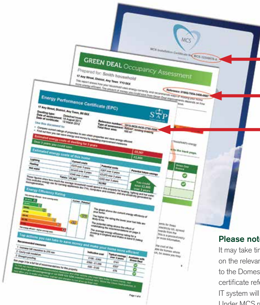
Figure 4. Find MCS number